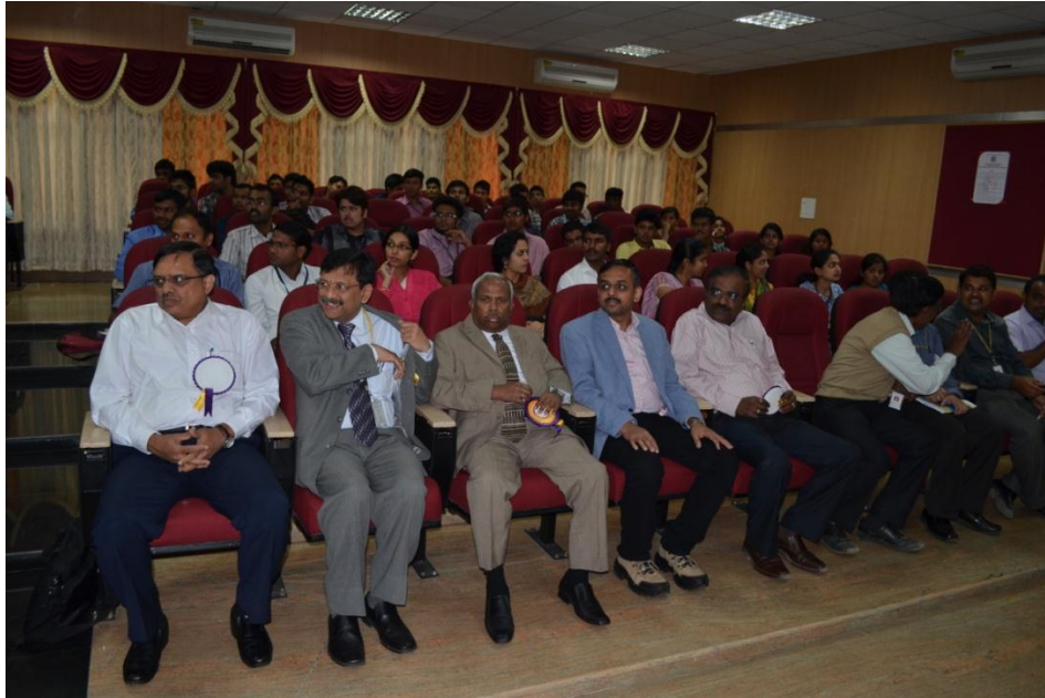
Workshop at RVCE, Bangalore