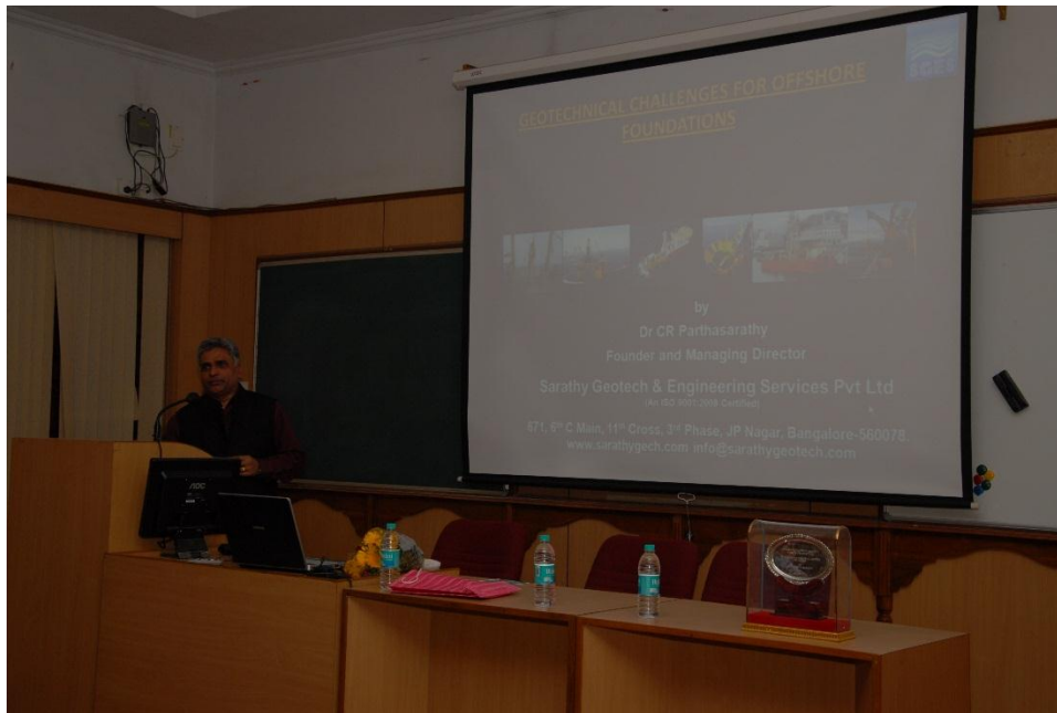
BK Ramiah Memorial Lecture, IISc, Bangalore