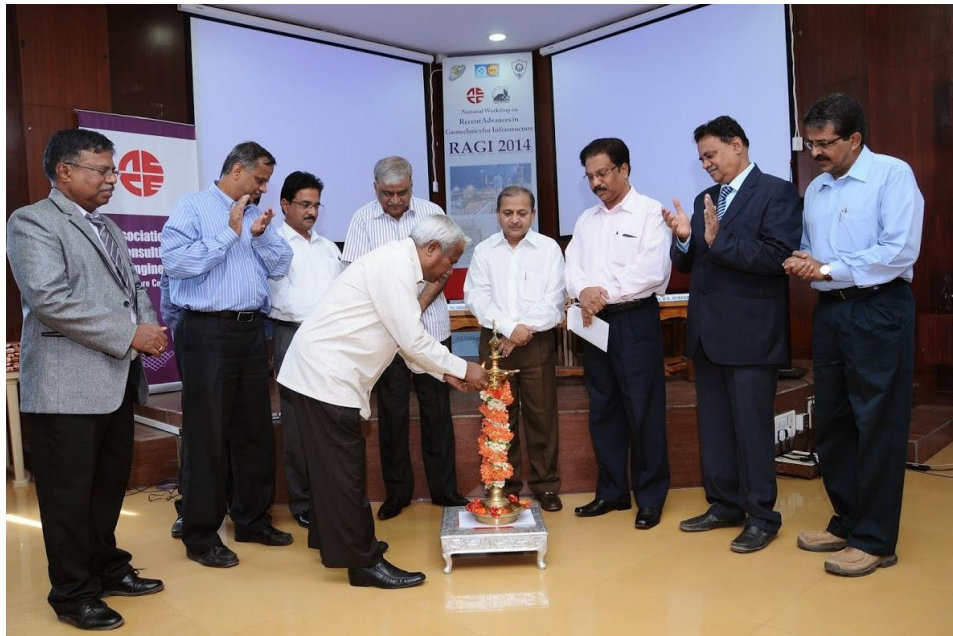
Inaugural Function of RAGI-2014 at SJCE, Mysore